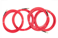
High Voltage Cable Assemblies