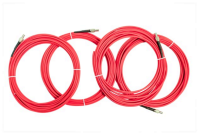
High Voltage Cable Assemblies