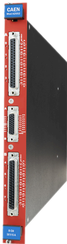
A2552: 8 Channel 16 V/6 A Full Floating Channel Boards, D-Sub 8W8 / DB37 connectors