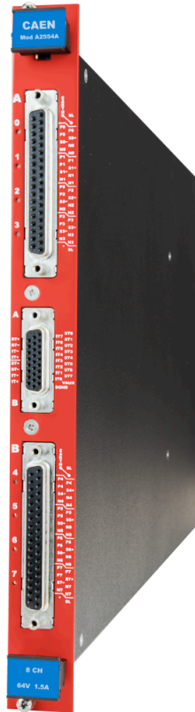
A2554: 8 Channel 64 V/1.5 A Full Floating Channel Board, DB37 connectors