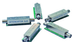
6 dB Attenuator