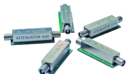
20 dB Attenuator