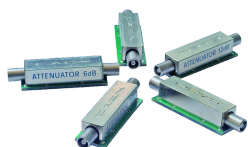
6 dB Attenuator