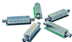
20 dB Attenuator