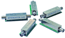
12 dB Attenuator