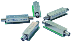
6 dB Attenuator