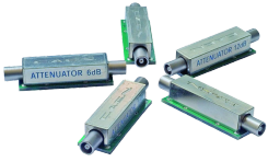
20 dB Attenuator