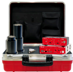
Educational Gamma Kit