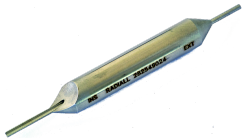
Insertion/extraction tool for A996