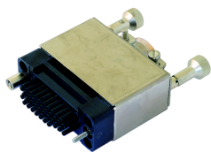
52 pin cable connector