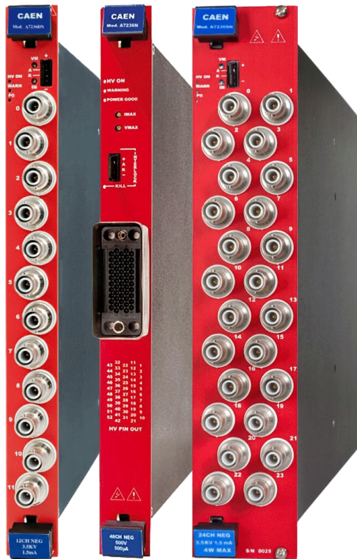
A7236 Family: 12/24/32 Channel 3.5 kV, 1.5/0.15 mA (4W) Common Floating Return Dual Range Boards, available with Negative / Positive Polarity, SHV / Radiall 52 /REDEL 51 connectors