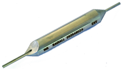
Insertion/extraction tool for A996