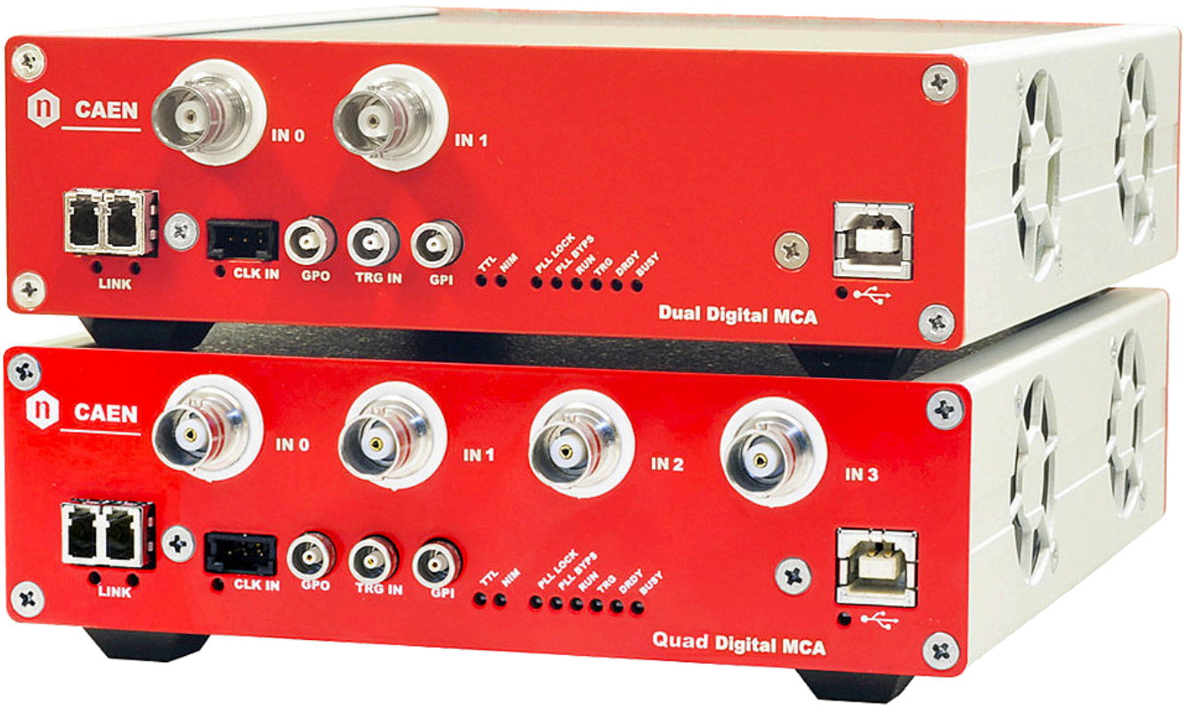
DT5781 Featured Image