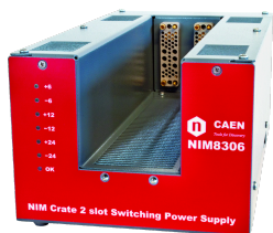
2 Slot Switching 750 W Mini Crate