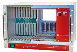
7U CRATE VME/NIM 8 slot VME64 365W, 5 slot NIM 150W