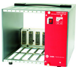
5U 5 slot 150 W Portable Crate