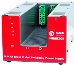
2 Slot Switching 450 W Mini Crate