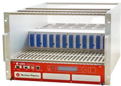
7U 12 slot smart fan unit Switching 2000 W Crate