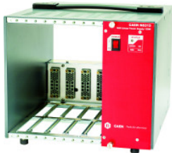
5U 5 slot 150 W Portable Crate