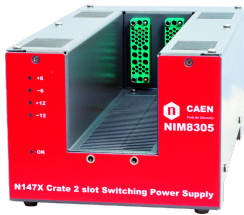
2 Slot Switching 450 W Mini Crate