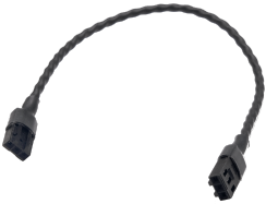
Cable assembly for Clock distribution 3-pin AMPMODU IV female terminations - 18 cm / 25cm