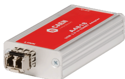
USB 3.0 to CONET2 Adapter