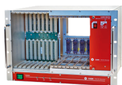
7U CRATE VME/NIM 8 slot VME64 365W, 5 slot NIM 150W