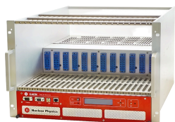
7U 12 slot smart fan unit Switching 2000 W Crate