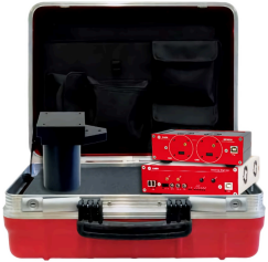
Educational Beta Kit