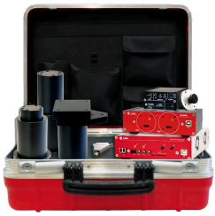
Educational Kit - Premium Version