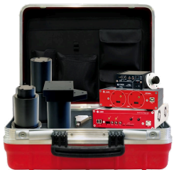
Educational Kit - Premium Version