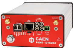
64 Channel Radioroc unit for FERS-5200