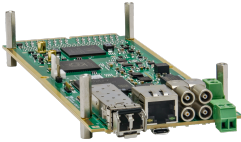
64 Channel Radioroc unit for FERS-5200