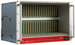
7U 21 Slot VME64 Low Cost Crate