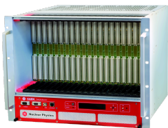
8U 21 Slot VME64/64X Enhanced Crate Series