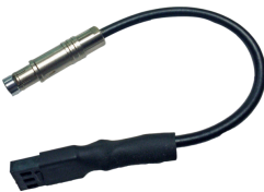
Adapter for Clock signal FISCHER S101A004 male to 3-pin AMPMODU IV female - 10 cm