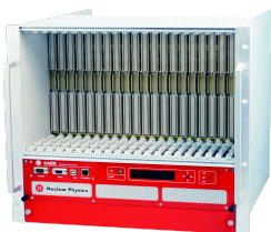
9U 21Slot VME64X Enhanced Crate series