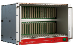
7U 21 Slot VME64 Low Cost Crate