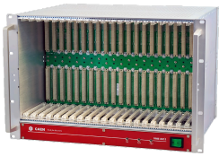
7U 21 Slot VME64 Low Cost Crate