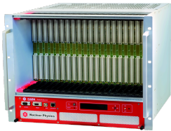
8U 21 Slot VME64/64X Enhanced Crate Series