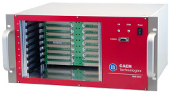
5U 9 Slot VME64 Mini Crate