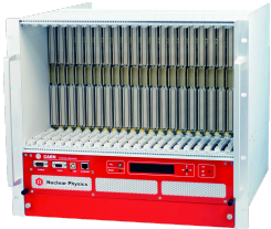
9U 21Slot VME64X Enhanced Crate series