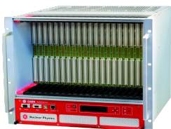
8U 21 Slot VME64/64X Enhanced Crate Series