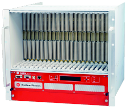
9U 21Slot VME64X Enhanced Crate series