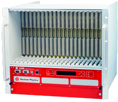
9U 21Slot VME64X Enhanced Crate series