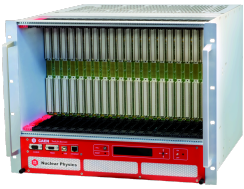
8U 21 Slot VME64/64X Enhanced Crate Series